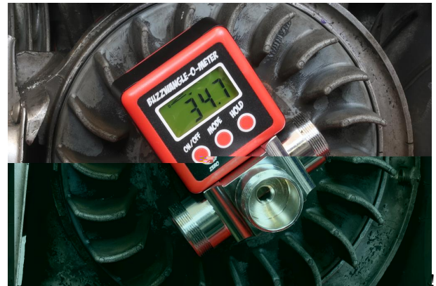
The Buzzwangle-O-Meter will read crankshaft rotation from any zeroed position from 0-360 with 0.1 degrees resolution.